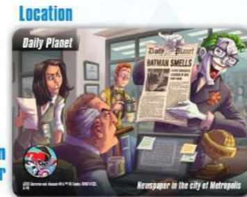
Harley Quinn Helper Indicator